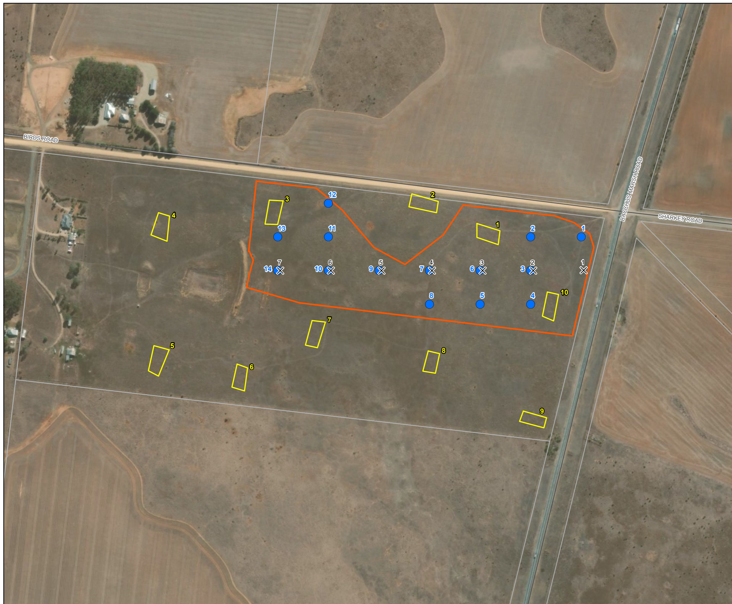
Figure 1 5-95 Birds Rd, Balliang – ecological monitoring year 1 - 2020