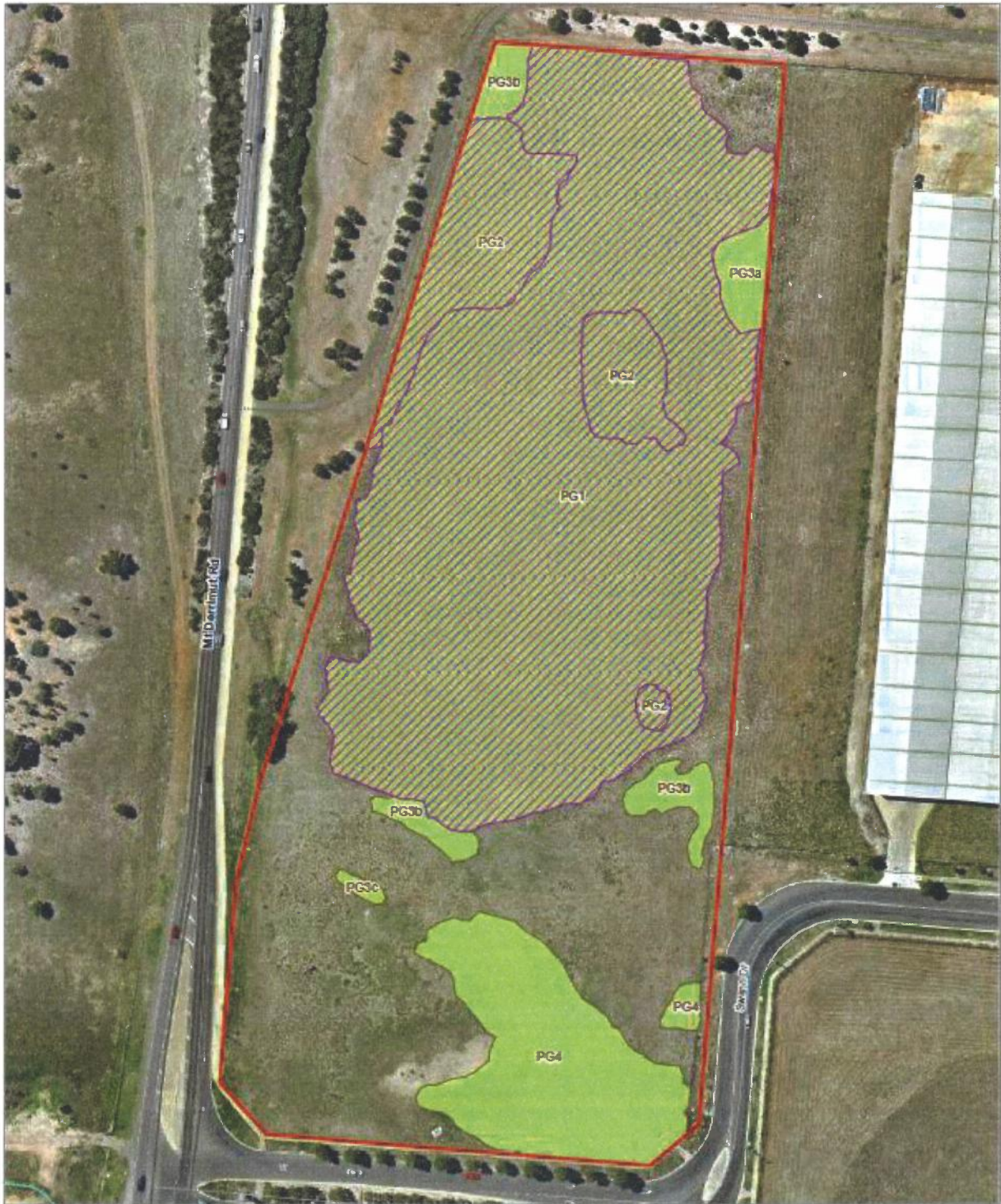
Figure 2 Ecological features 210 Swann Drive, Derrimut