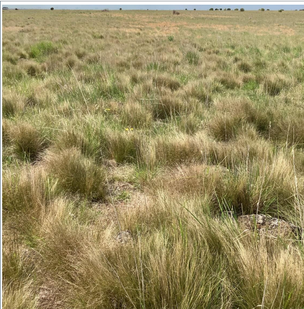
Image 1. High coverage of untreated and seeding Serrated Tussock *Nassella trichotoma